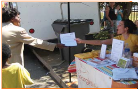
ALLISON WALL TELLS A CONSUMER ABOUT CREDIT FREEZE IN PLAINS, GA.